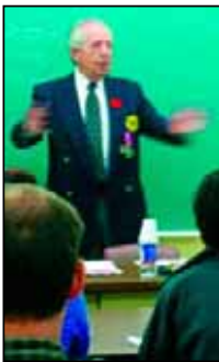
Taking the message to the schools.

TORONTO When any of the 1,500 volunteers registered with the Memory Project Speakers Bureau appear in classrooms and before community groups across the country, they usually soon talk about an episode in history which involves more than one country. To share the history of Canada's sacrifices for freedom, they often switch to talking about their experiences in the Netherlands and neighbouring countries. The volunteers of these speaking engagements are none other than Canadian veterans who served overseas.